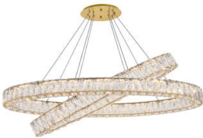
Gold Item No:3503D48G