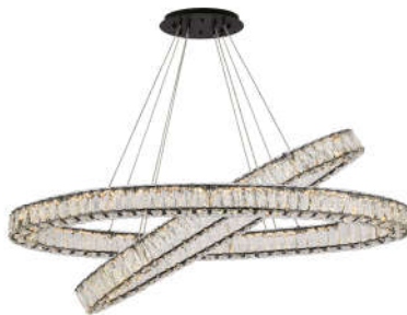
Black Item No:3503D48BK